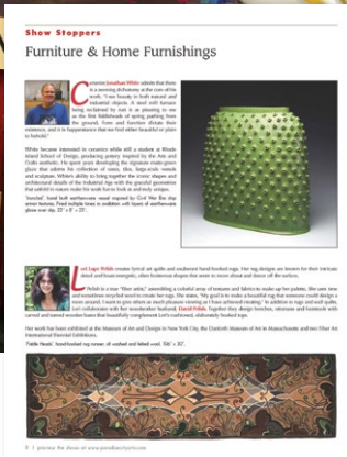
Above: Each Paradise City Guide showcases a selection of that season's exhibitors.