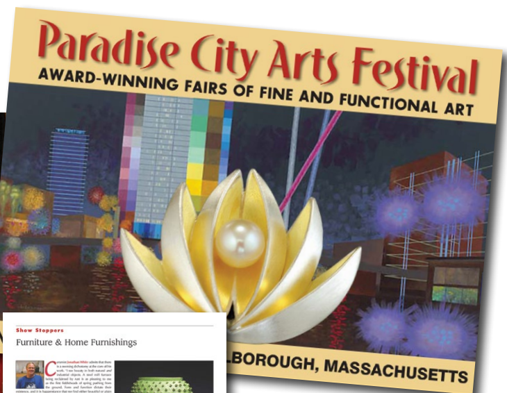
Above: Paradise City sends out free postcard mailings to artists' customers prior to their shows.

The directors also mount themed exhibitions at each event, with titles like "Wild Things," "Face to Face," "The Nature of Beauty," and this fall's exhibit,