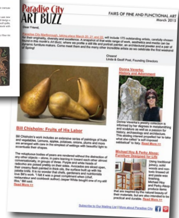
Right: The monthly Art Buzz e-newsletter has nearly 40,000 subscribers and is still growing.

"Eat, Drink, and Be Merry!" These special shows are open to all exhibitors and provide added visibility and publicity to participating artists. In addition, they encourage the artists to think outside the box and try showing work created in a different media, aesthetic, or concept. In a similar vein, there is a "People's Choice Award for Outstanding Outdoor Art" in the Northampton event's permanently landscaped outdoor Sculpture Garden and Courtyard. In this case, scale is often the inspiration. Many exhibitors build pieces to place in the very popular Sculpture Garden that would never fit in a standard indoor booth. Large-scale outdoor sculpture has become one of the best-selling media categories at Paradise City's shows.